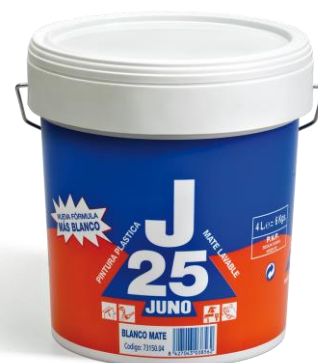
Format: 4L / 15 L

The information contained in this data sheet may change and must be updated. Consult www.junopaints.com or your nearest JUNO representative to obtain the most recent data sheet. The technical advice of application, whether verbal, written or through trials, are based on the experience and technical knowledge of JUNO. The data shown in this document should be considered a recommendation and as such does not imply any commitment, even with regard to possible industrial property rights of third parties. The application, employment and transformation of the products supplied by JUNO are carried out by third parties. Consequently, the final result is the sole responsibility of the client, applicator or manipulator of the products and not of the supplying company. This document does not exempt the client from carrying out his own examination of the products supplied, in order to verify their suitability for the procedures and intended purposes. In case of responsibility assumed by JUNO, it will be limited to the strict value of the goods supplied and used by the customer, whatever the damages and losses caused. JUNO guarantees the quality of all its products, in accordance with the current General Sales Conditions.